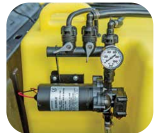
Pump & Manifold Assembly