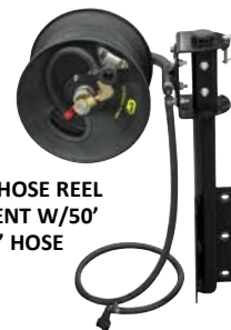
OPTIONAL HOSE REEL ATTACHMENT W/50' OF 3/8" HOSE