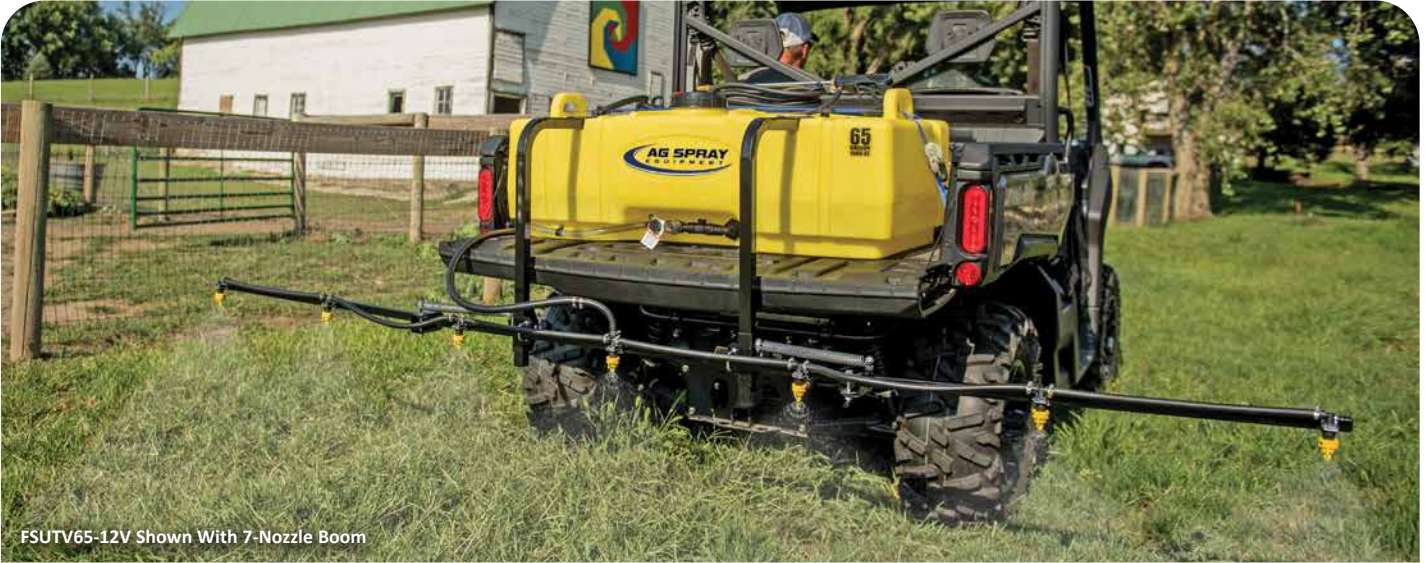
FSUTV65-12V Shown With 7-Nozzle Boom