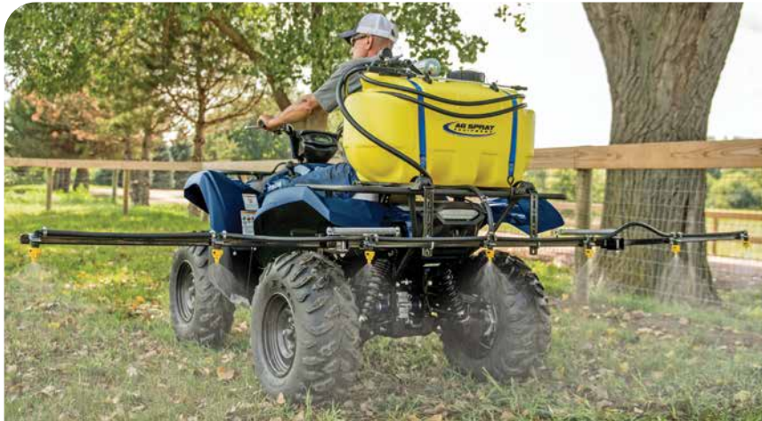
FS-ATV-25 Shown With FSBK-70 Boom (7-Nozzle). Boom Not Included.