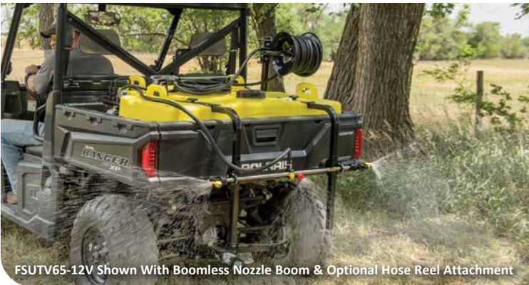
FSUTV65-12V Shown With Boomless Nozzle Boom & Optional Hose Reel Attachment