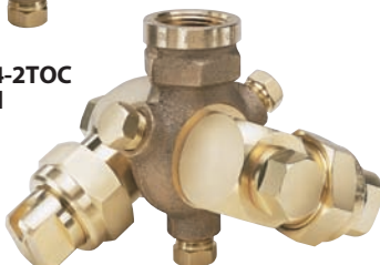
Type 4418-3/4-2TOC Double Swivel with 3/4" NPT (F) pipe connection. Brass.