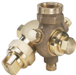
Type 4629-3/4-TOC Single Swivel with 3/4" NPT (F) pipe connection. Brass.

W = Maximum effective coverage with nozzle mounted at 36" height.