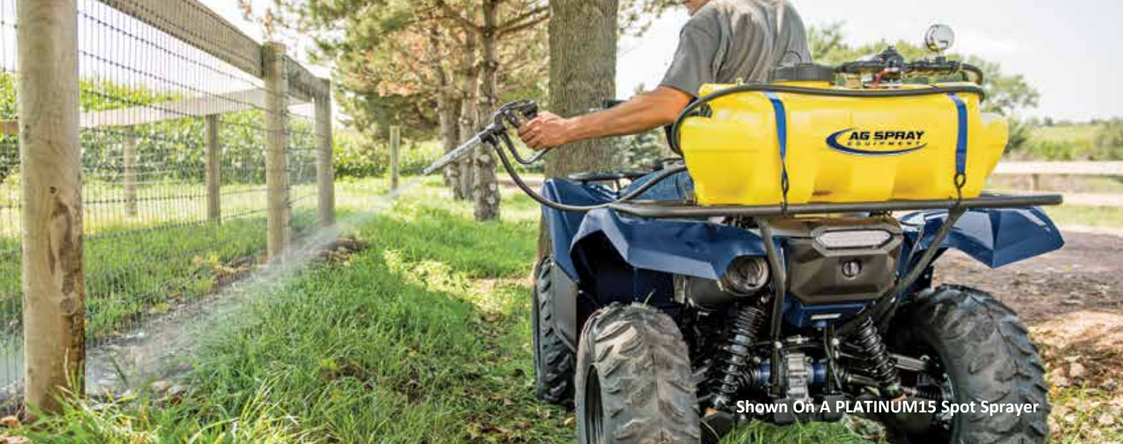
Shown On A PLATINUM15 Spot Sprayer