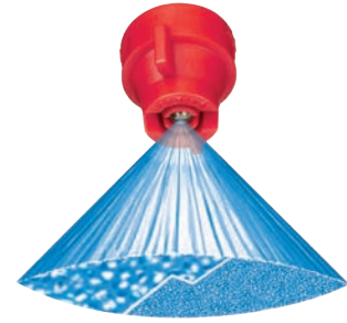
At 15 PSI (1 bar) Pressure At 60 PSI (4 bar) Pressure