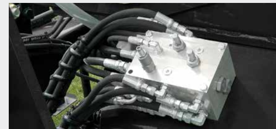
Hydraulic Control Module