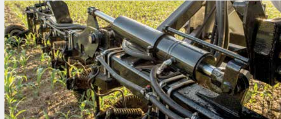
Double Cylinder Allows The Gullwing & Main Lift To Be Controlled With One Hydraulic Remote