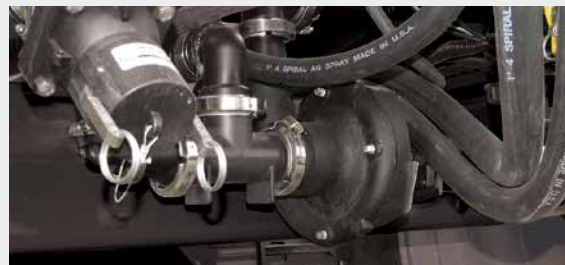
Hydraulic Drive Pump with PWM Valve