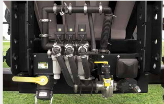
Easy Access Rear Mounted Plumbing