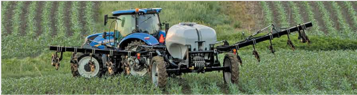
Auto Gull Wing function allows the wings of the bar to automatically tilt up when main bar is raised for greater turning clearance.