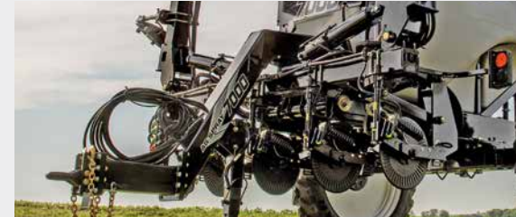
Close coupled machine, 139" hitch pin to axle