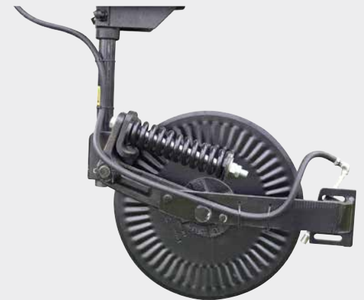
Heavy Duty Coulters