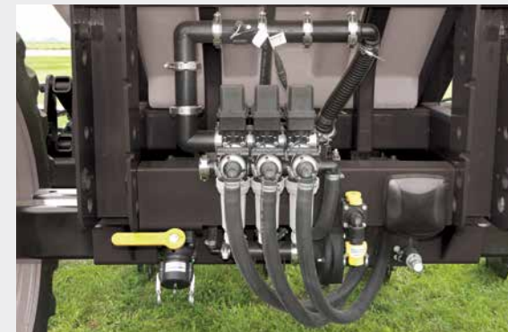
Easy Access Rear Mounted Plumbing