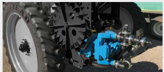
Ground Drive Press Wheel