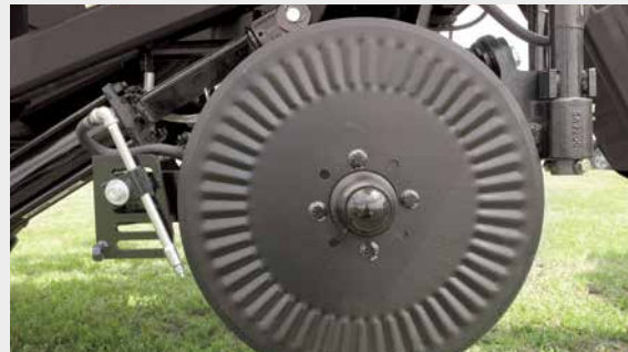
20" Coulters With HD Down Pressure Spring