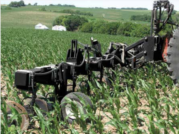
3 Point Para-Arm Link System

Utilize tractor mounted tanks to side dress nutrients. The Para-Arm Link system moves the Toolbar back for better operator visibility.