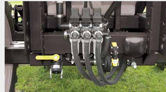
Easy Access Rear Mounted Plumbing