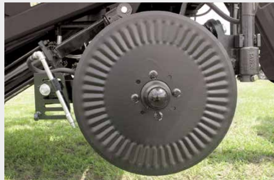
20" Coulters With HD Down Pressure Spring