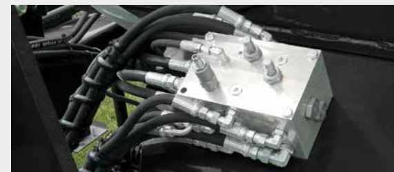
Hydraulic Control Module