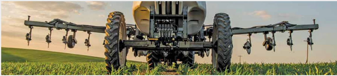
The LA7000's gullwing feature tips the wings 7° for greater clearance.