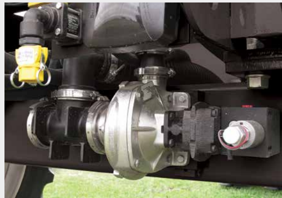
Hypro Stainless Steel Pump With Silicon Carbide Seal & PWM Valve