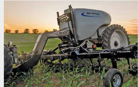
Close Coupled Machine, 175" Hitch Pin To Axle