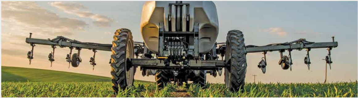
7 Degree Gullwing Feature Guarantees A Minimum 66" Toolbar Height For Greater Turning Crop Clearance